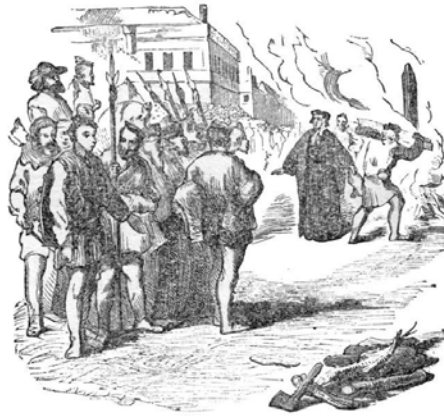
Luther burning the papal bull

was he a member of the Roman Catholic Church. Many people in Wittenberg were glad; they agreed with Martin Luther.