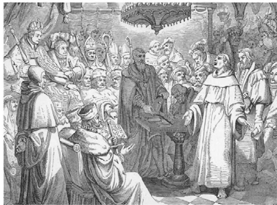
Luther at the Diet of Worms

Martin Luther’s friends were frightened. Even though Luther had been given a safe conduct, again they couldn’t help but think about John Huss. He also had been given the pope’s promise that he would be protected, but he had been burned at the stake. Luther, however, assured them that he was not afraid. He believed the Lord wanted him to go to Worms. “Even if there were as many devils in Worms as there are tiles on the rooftops, I must go,” he said firmly.