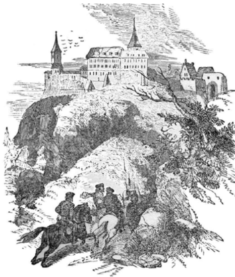
The Castle at Wartburg

with the help of friends, completed the translation of the entire Bible. He also wrote letters to other friends, but he did not sign his name on them. His friends knew then that Luther was safe, though they had no idea where he was or who had “captured” him.